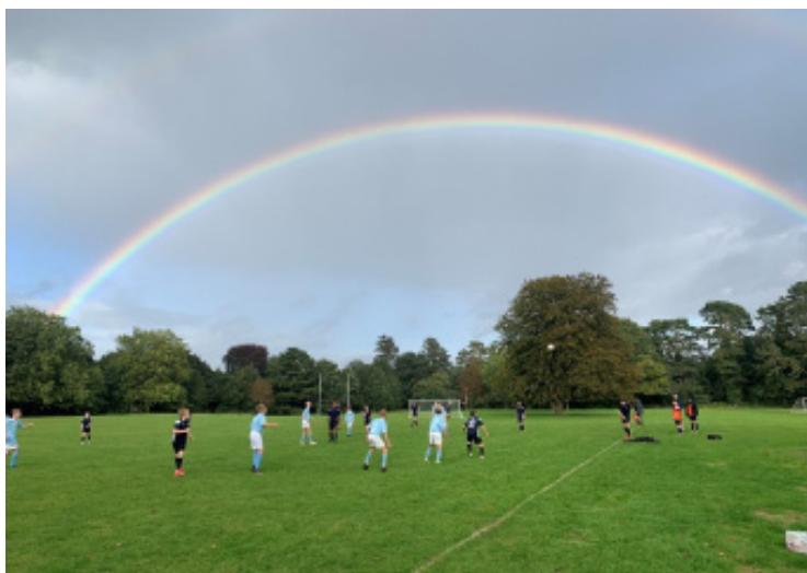
in the 5-4 win vs St. Gregory School

The U13's had the painfully long wait to represent their school having not been able to play last year. When they finally did play, they didn't disappoint. The B team started the season off with a well fought and deserved win vs St Gregory School in the ESFA